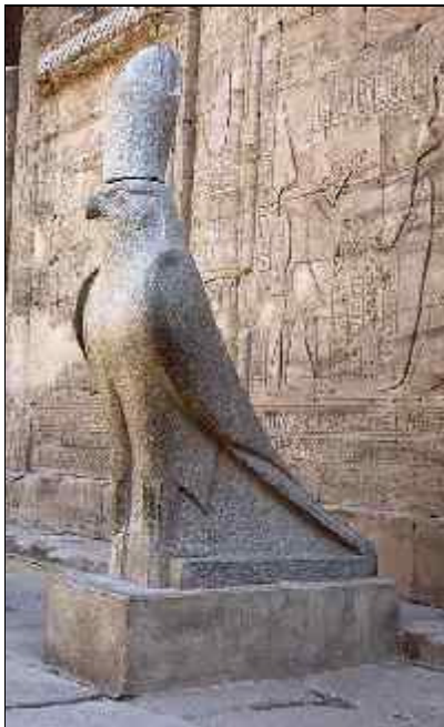
Horus of Edfu

opposed him, 2 that they could neither see with their eyes nor hear with their ears, and each of them slew his fellow. In a moment of time there was not a single creature left alive. Then Heru Behutet, shining with very many colours , came in the form of the great Winged Disk to the Boat of Ra-Harmachis, and Thoth said unto Pa, "O Lord of the gods, Behutet hath returned in the form of the great Winged Disk, shining [with many colours] ..... children;"