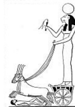
Asthertet Source: Naville, Mythe d'Horus ► Teb : Edfu

► grapes : drops of blood ► Asthertet : Ashtoreth ?