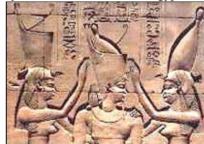
Wadjet on the left, Nekhbet on the right